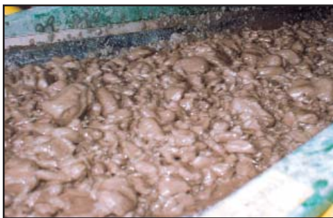
Flo-Line Primer removing large drilled cuttings at 10 mesh.

The Cascade 2000 is a component-based system, allowing the two modules to be run independently if desired.