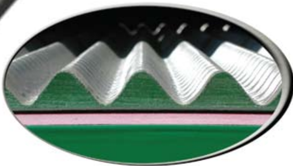
Pyramid™ Screen (PMD™)