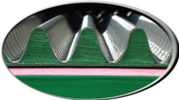
Pyramid™ Plus Screen (PMD+™)

Derrick Equipment Company revolutionized screening technology in 1994 with the introduction of the patented Pyramid™ (PMD™) screen design. This three-dimensional screen design offers the benefits of traditional flat, multi-layered screens while adding a substantial increase in usable screen area. The result is a screen that allows for an increase in fluid handling capacity. Pyramid screens allow rigs to screen finer earlier in the drilling process, thus significantly reducing total drilling fluid and disposal costs.